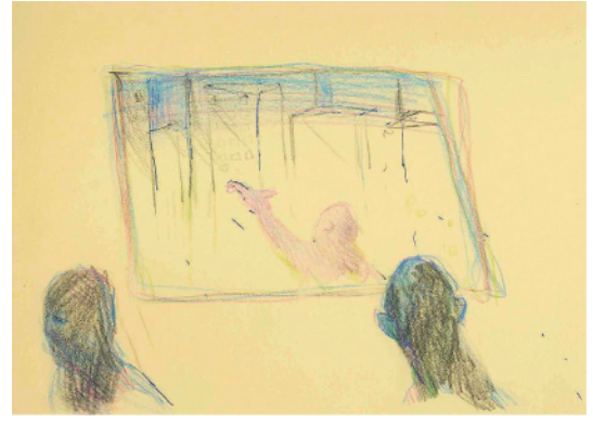
Tadayoshi YUKI "DR2011054" 2011, H110 × W140mm, colored pencil and ballpoint pen on paper