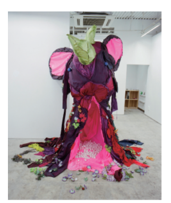
Yuukyuusai "Mayoiga" 2008, variable size, mixed media