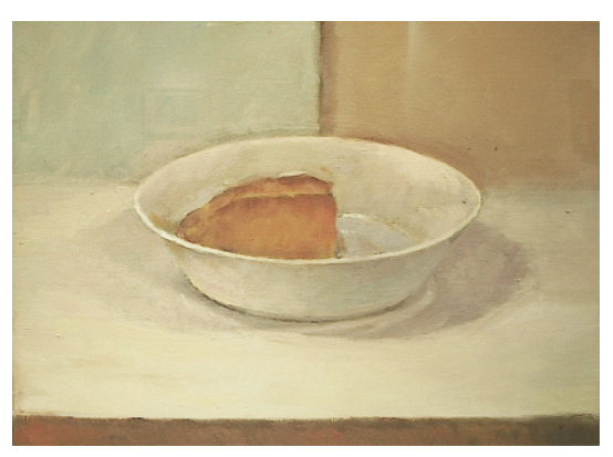
Kouichi DEAI "Seisan" 2012, H242 × W333 mm, oil on canvas

Takeo KOBAYASHI "Sugimura" 2012, H333×W242mm, oil on canvas