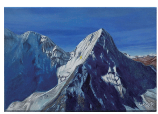
Toshio YAMAGUCHI "GEP (Google Earth Painting) -cholatsu-" 2011, H158 × W228mm, oil on canvas